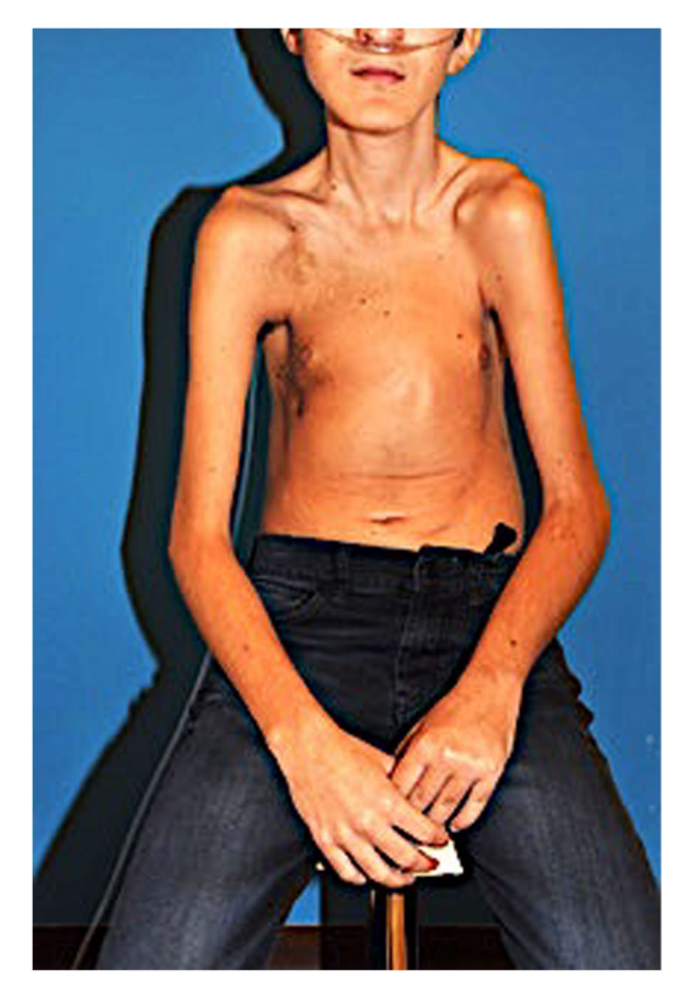
Fig. 1 Restrictive pulmonary syndrome, associated with scoliotic deformity, respiratory muscle atrophy, and growth restriction

At the time of our first consultation in 2017, he was presenting with persistent grade 4 dyspnea, as well as daily headache and recurrent pulmonary infections (3-4 episodes per year). He was completely dependent on oxygen, with 2 L/min, 24 h a day (with BiPAP for 8 h at night) and 3 L/min for exercice, such as walking 100 m to catch the bus to school 5 days a week. He was unable to do any other effort or practice any sport. The patient was cachectic, with a body mass index of 14 (Fig. 1). Forced Expired volume in one second (FEVS) was 600 mL (22% of predicted values), Forced Vital Capacity (FVC) was 600 mL (15% of predicted values) and Total Lung Capacity (TLC) was 1.690 L (40% of predicted values) (Fig. 2).